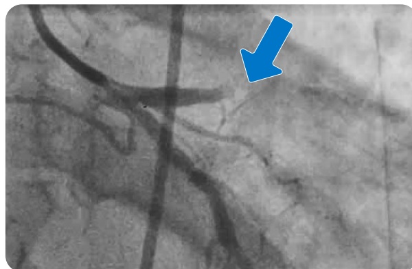
Figure 1. Pre-PCI Angiography of LAD

Per IC-HOT protocol, a follow-up visit was conducted at 30 days. EDV and ESV were measured via MRI noted at 134 ml and 49 ml, respectively. The abnormal LV myocardium hyperenhancement seen at day five had visibly resolved. Ejection fraction showed an improvement at 63% vs 48% measured at day five.